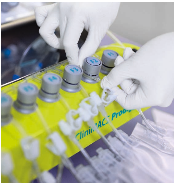
Figure 1: The installation of the CliniMACS Formulation Set is guided by the user-friendly CliniMACS Prodigy touchscreen.

The CliniMACS Formulation Set is a single-use, biocompatible tubing module that must be connected to the CliniMACS Prodigy Tubing Set. It allows for automated sampling and contains eight EVA product bags, ready for both fresh or frozen product strategies.