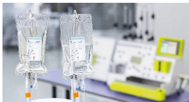
Figure 3: CliniMACS Formulation Solution and Cryo Supplement come in one liter bags and can be sterile-connected to your process setup.

CliniMACS Cryo Supplement, 3x can be sterile-connected to the CliniMACS Formulation Set and is the perfect choice for the cryopreservation of your cells. In combination with the CliniMACS Formulation Solution it serves as a freezing solution with 7.5% DMSO final concentration.