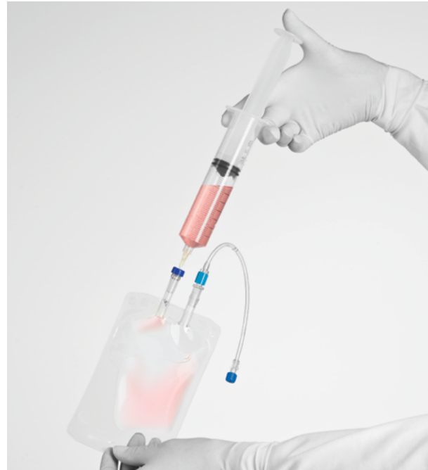
Figure 7: Medium-filled syringe attached to the septum port.