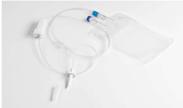
Figure 10: Spike and male luer lock set attached to the female luer lock of the MACS GMP Cell Differentiation Bag.

Method 1: Aseptically connect the male luer lock end of a spike and male luer lock set to the female luer lock at the tubing of the MACS GMP Cell Culture Bag. Aseptically insert the spike end into the spike port of the medium bag.