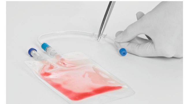
Figure 6: Cutting through the central seal.