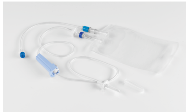
Figure 11: Spike and needle set attached to the septum port of the MACS GMP Cell Differentiation Bag.

Method 2: Aseptically connect the needle end of a spike and needle set to the septum port of the MACS GMP Cell Culture Bag. Aseptically insert the spike end into the spike port of the medium bag.