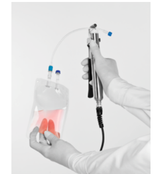
Figure 5: Sealing of the tubing with a dielectric sealer.