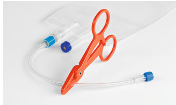
Figure 3: Clamped tubing.