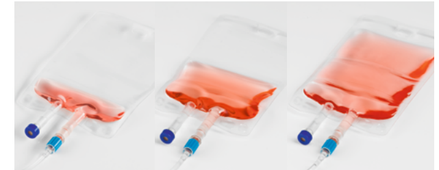
Figure 8: Consecutive filling of the compartments of the MACS GMP Cell Expansion Bag.

The MACS GMP Cell Expansion Bag has three compartments with easy-to-open seals to allow for an expandable culture volume. Make sure to carefully remove air from the bag when filling the first compartment to prevent premature opening of the first seal.