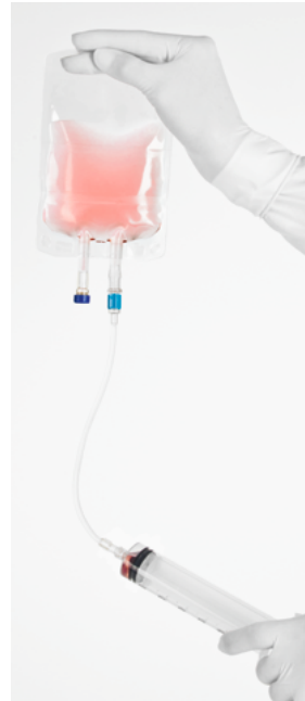
Figure 16: Empty syringe attached to female luer lock of a MACS GMP Cell Culture Bag.