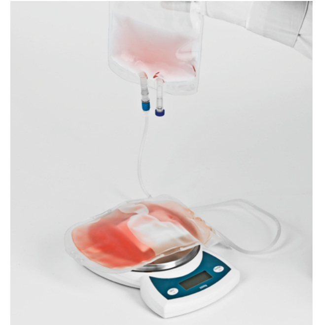
Figure 12: Fluid transfer from MACS GMP Cell Culture Bag into new receiving bag.

Note: Seal tubing close to the spike to ensure adequate tubing is left for future sterile docking connections, if needed.