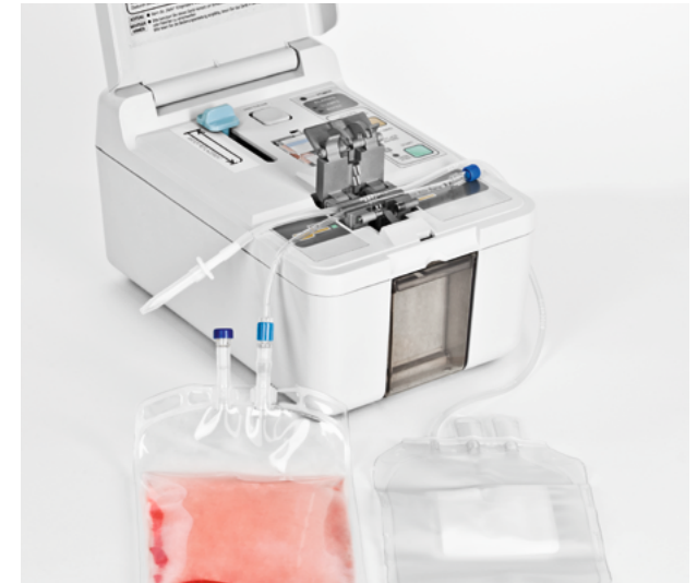
Figure 14: MACS GMP Cell Culture Bag and new receiving bag installed in an SCD.