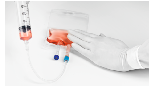
Figure 9: Opening a seal of the MACS GMP Cell Expansion Bag.

To open the next compartment, transfer additional medium as necessary and apply gentle pressure to the fluid in the direction of the seal until it is fully opened.