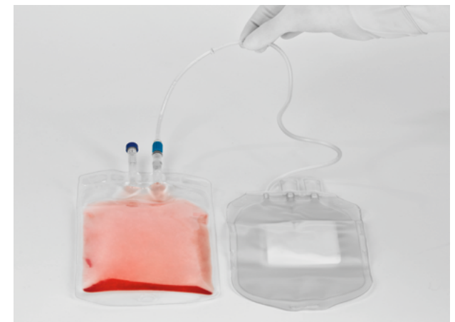
Figure 15: MACS GMP Cell Culture Bag and new receiving bag after sterile connection.