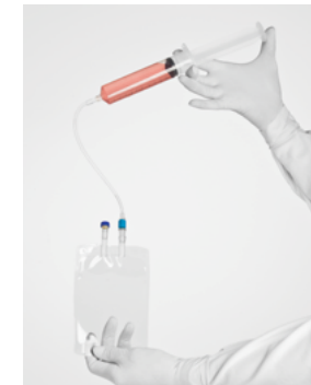
Figure 4: Medium-filled syringe attached to the female luer lock of the MACS GMP Cell Culture Bag.