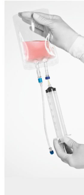
Figure 17: Empty syringe attached to septum port of a MACS GMP Cell Culture Bag.