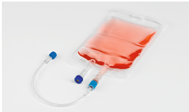
Figure 2: MACS GMP Cell Differentiation Bags are equipped with a septum port (left) and a tubing with female luer lock and cap (right).

For the aseptic transfer of small volumes (20–130 mL) into MACS GMP Cell Culture Bags either the female luer lock or the septum port can be used.